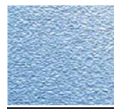
Textured Fingertips for a Better Grip